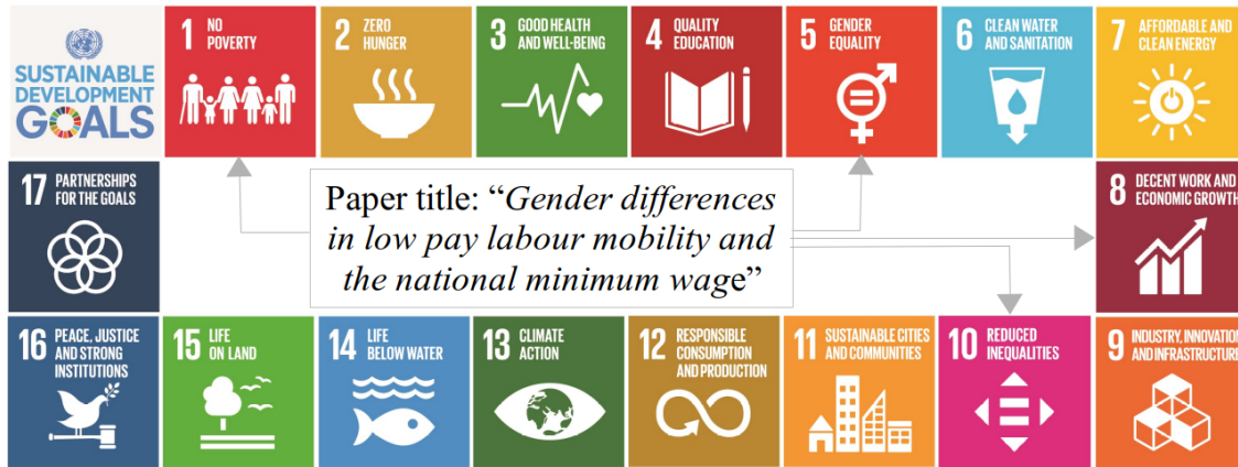
Figure 1: SDG headlines and an example of the targeted task. In this example, the system should classify the title of the scientific paper in SDGs 1 "No poverty", 5 "Gender equality", 8 "Decent work and economic growth", and/or 10 "Reduced inequalities"

way than investing in manual-labelling of samples.